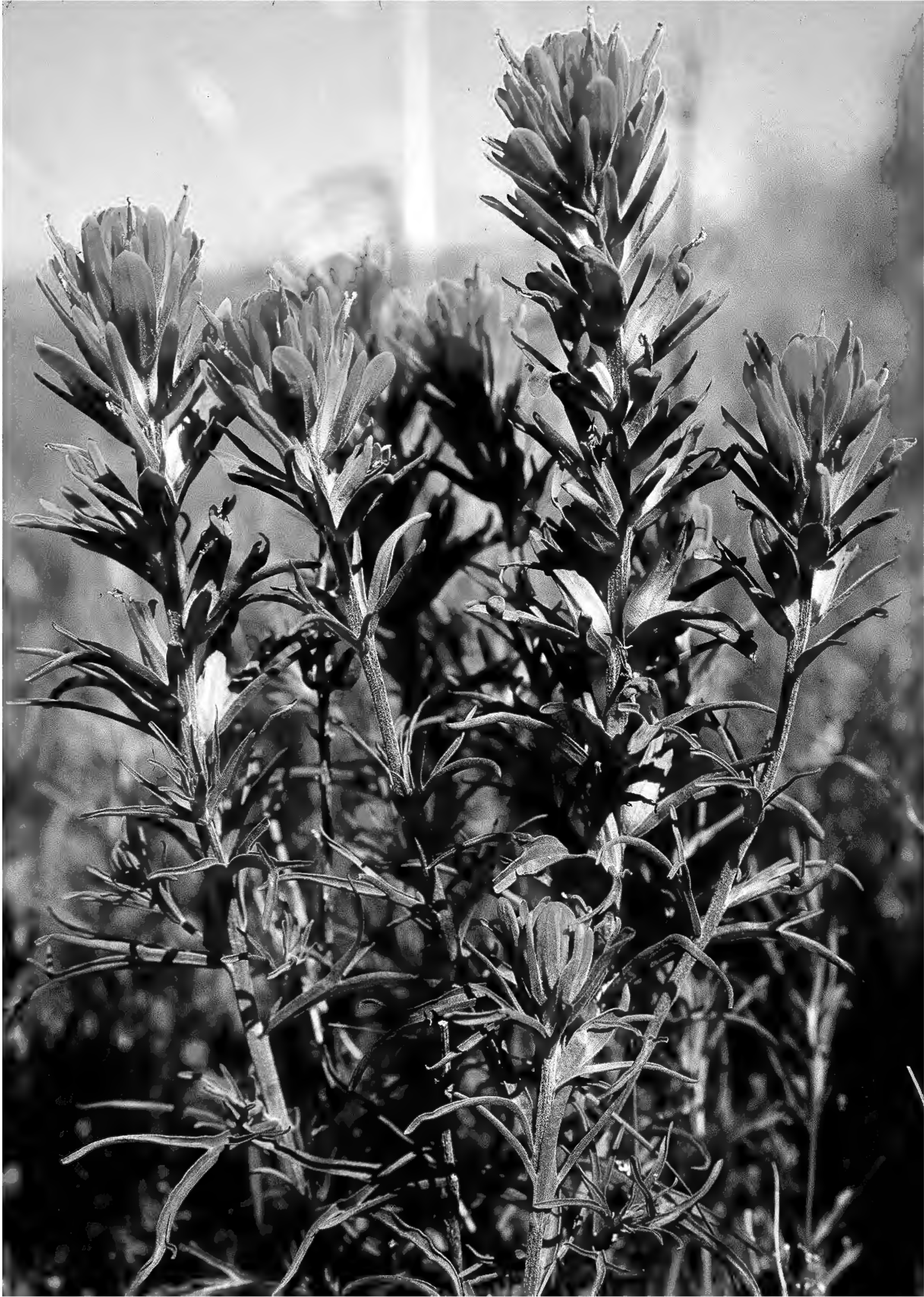
Figure 11. Castilleja lindheimeri in typical form. West of Lometa, Lampasas Co., Texas, 20 Apr 1997.